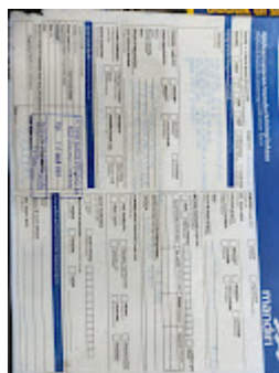
WhatsApp Image 2021-03-10 at 10.53.07.jpeg 202K